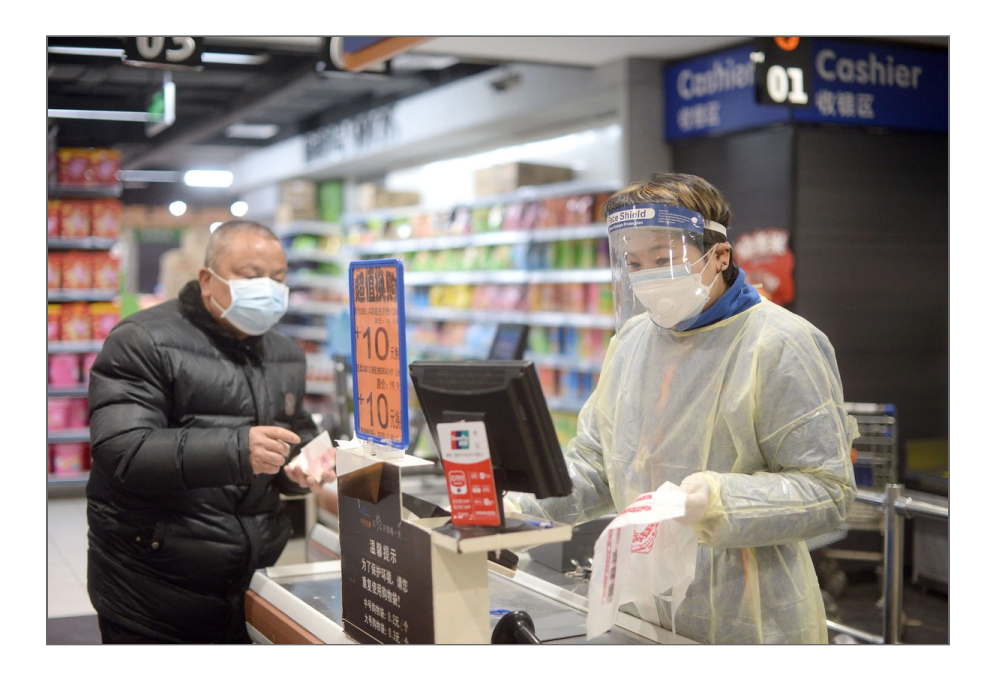
10. A cashier in protective gear works at the checkout of a supermarket in Wuhan on February 10, 2020. #