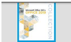
ITMG 100 - Fall 2020 Master - Shelly Cashman Series - Office

Mindtap for Principles of Information Systems, 13 th Edition, Stair/Reynolds, 2018. PUBLISHER: Cengage