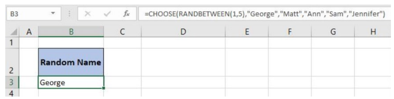
Figure 1. The final result of the formula

Excel allows us to get a random number from a range using the CHOOSE and RANDBETWEEN functions. This step by step tutorial will assist all levels of Excel users to learn how to randomly generate words in Excel.